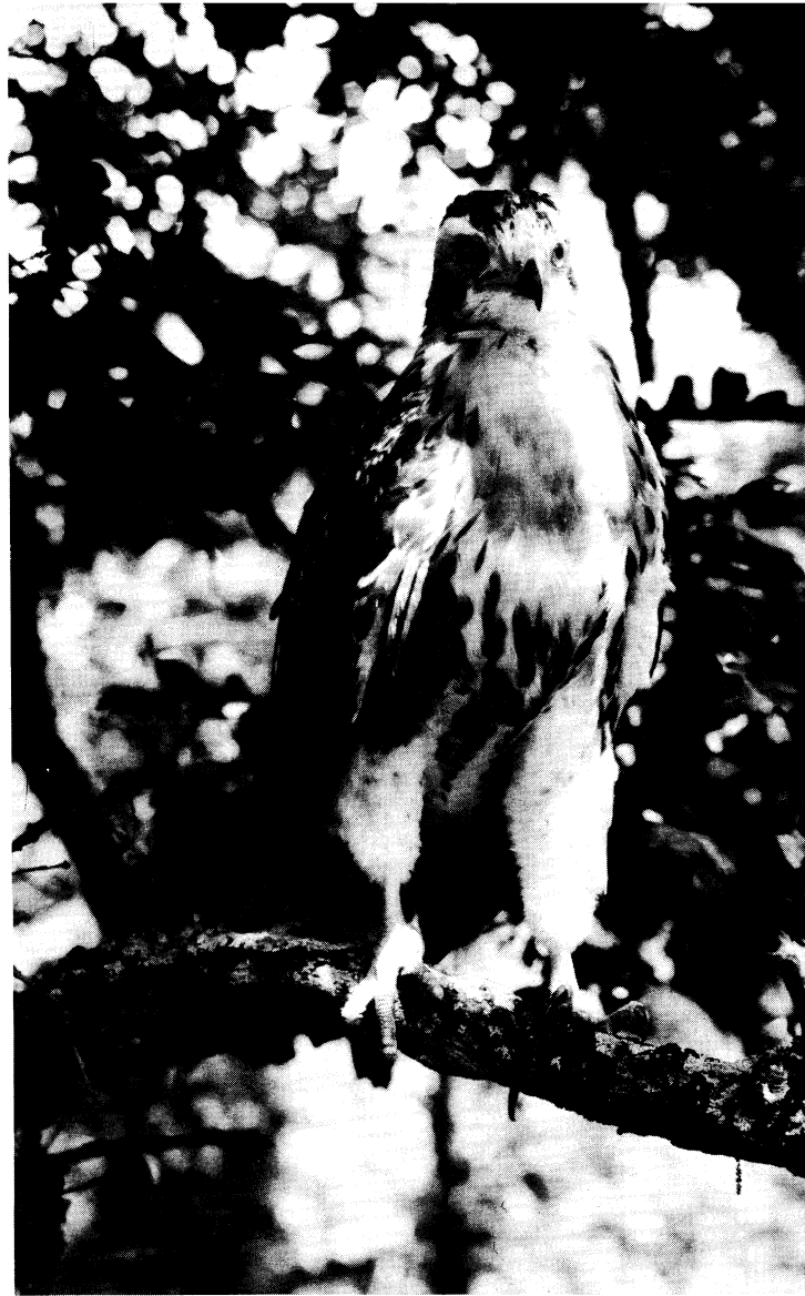
A young Red-tailed Hawk

It isn't always easy to identify them; the smallest of them, the sparrowhawk, the one we see on hydro and telephone wires, is easy to identify. So are the red-tailed and red-shouldered hawks, the latter appearing all over Canada. Their names say enough. Unless we make a study of all the different kinds, including all the colour phases their young go through, it is extremely difficult to tell them apart. I wonder how many times it has happened to me that in order to identify a hawk in a nearby tree, I stopped the car only to see the hawk take wing. They know enough to realize that moving traffic offers no threat, I suppose. Almost two centuries of persecution have made them