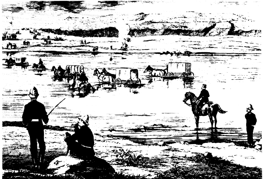
Two months after leaving Dufferin, Man., on September 12, 1874, on the Great March West, the travel-worn N.W.M.P. cavalcade arrived at the junction of the Bow and Belly Rivers in the land of the Blackfoot.

When they struck out from the small southern Manitoba settlement of Fort Dufferin, the N.W.M.P. troopers were undertaking one of the most ambitious treks in the country's history. Their destination, about 700 little-charted miles away, was the fork of the Bow and Belly Rivers near the site of present-day Lethbridge, Alberta. There they expected to find