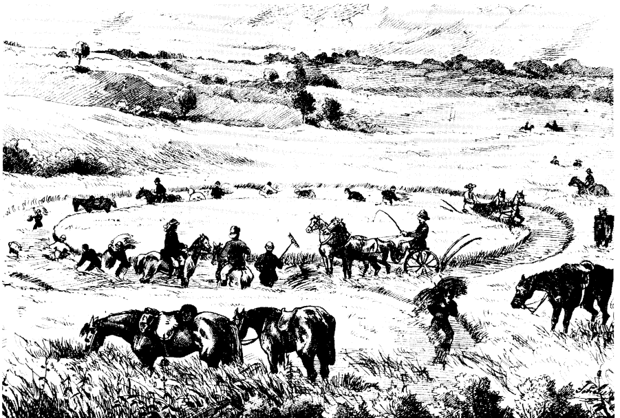
During the March West, N.W.M.P. constables used the mowing machines, scythes and other agricultural tools to harvest the prairie grass they encountered on the way. The grass was fed to the oxen, beef cattle and horses as fodder.