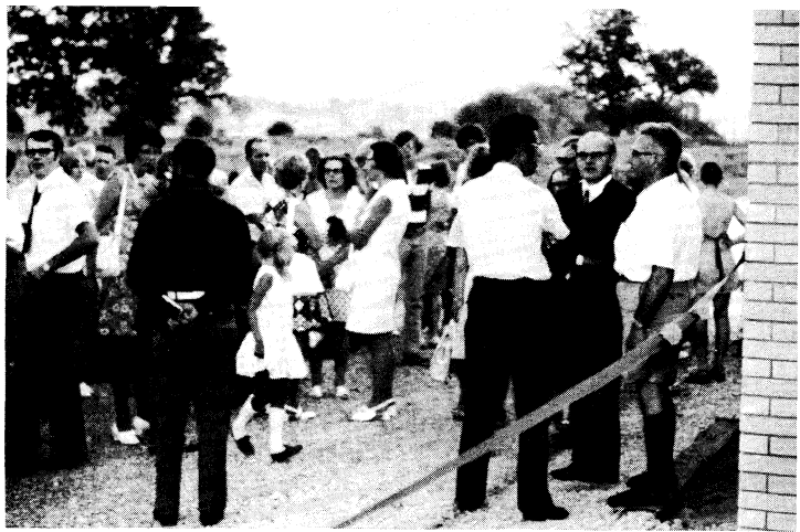
Waiting for the ribbon-cutting ceremony marking the opening of the Timothy School, Hamilton. [For a detailed report, see the Sept. 22 issue. ]