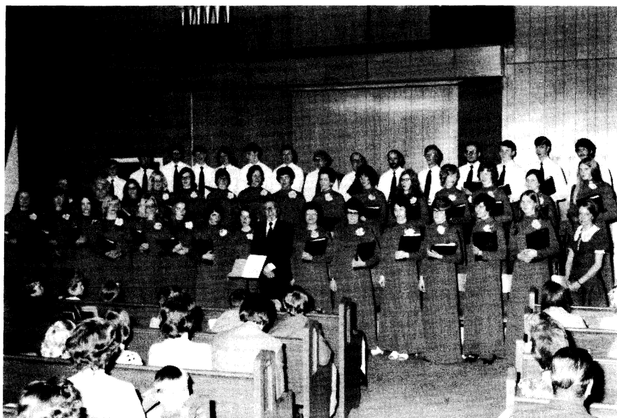
"Te Deum Laudamus" Choir Fergus - Guelph — at their spring concert.