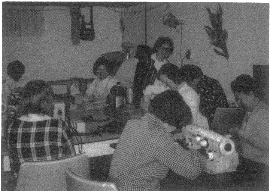
ROARING SEWING MACHINES

Ladies Aid of Winnipeg busy sewing and mending clothes for Brasil and Korea. [see Clarion Volume 23 - No. 11, June 1, 1974 issue.]