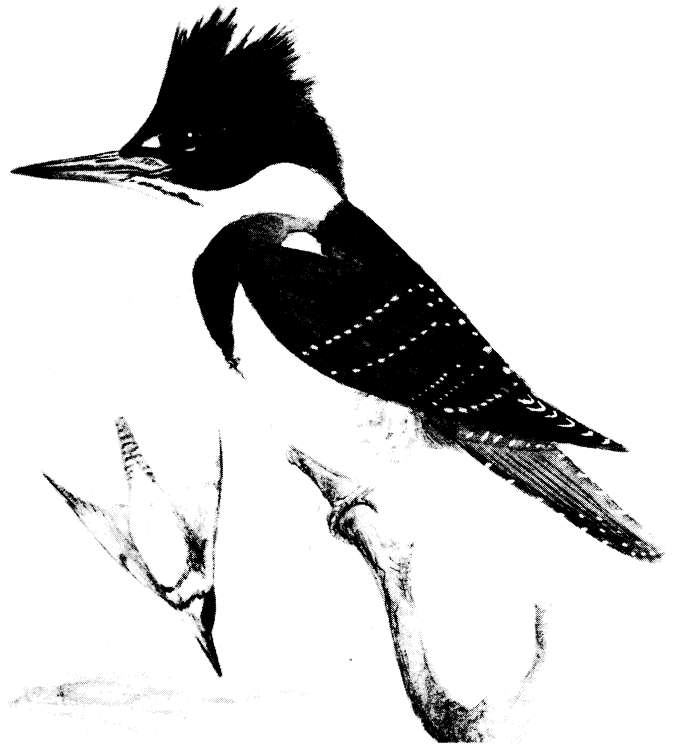
Belted Kingfisher

The vireos who all during summer have sung in our backyard from early morning till dusk, have already flown south. For a few days in late August their concert was accompanied by the whistles of Baltimore orioles, who are known to sing only during nesting and breeding time and