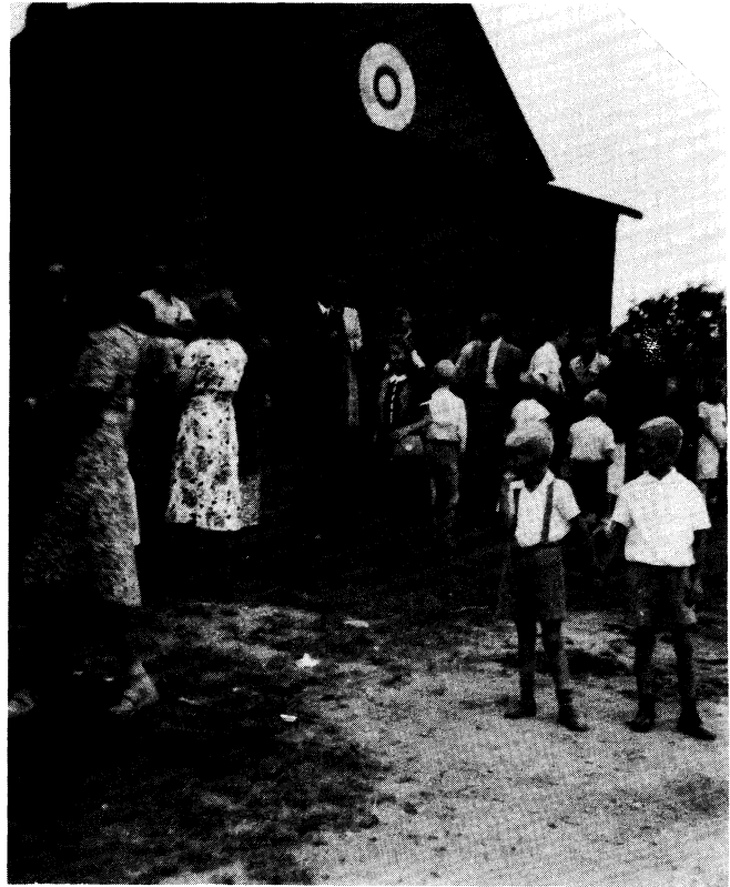
In 1951 the worship services were held in the Orange Hall, two miles north of Orangeville.