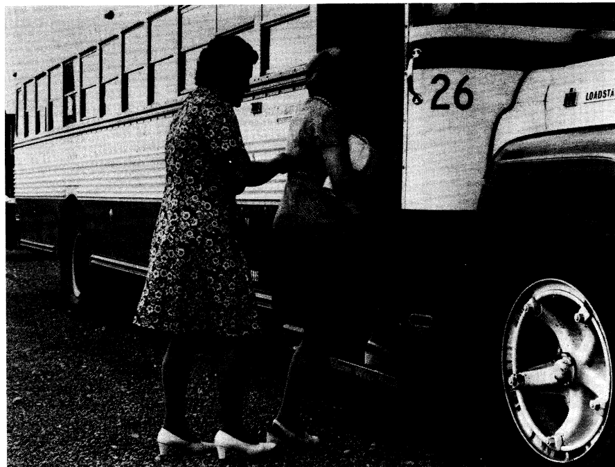
At 7:45 a.m. a bus picked up the bulk of the Smithville sisters who attended the meeting. Others came by private transport.