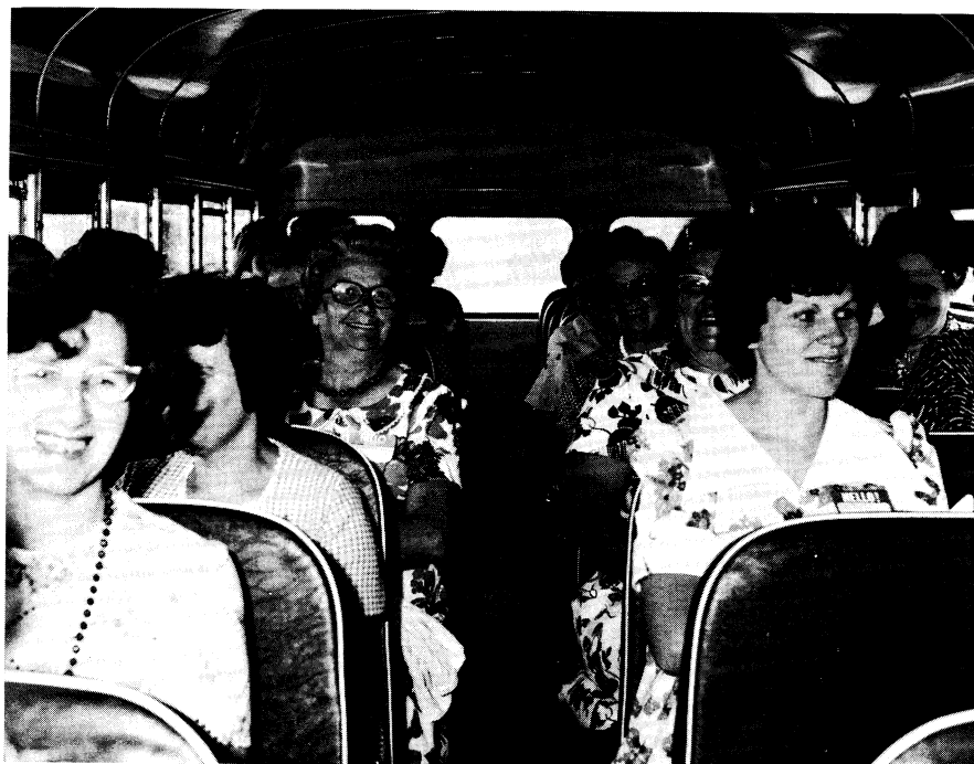
"k Heb m'n wagen volgeladen . . ."