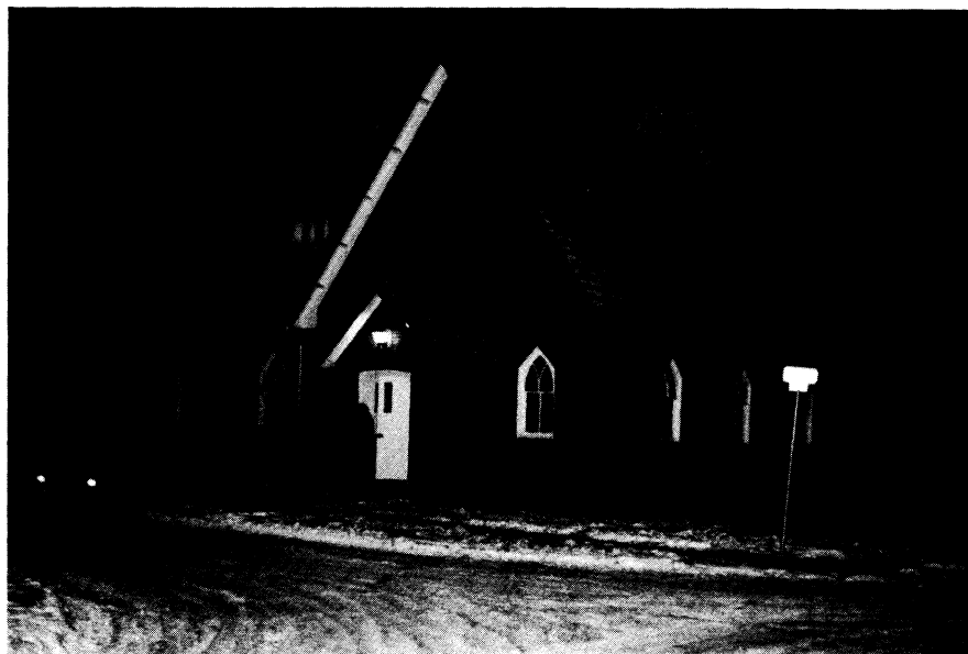
The Guelph Churchbuilding in the evening stillness.

But let us be aware and say that the fault is not in the home but in the sinful heart that has turned away from the living God and His Christ. The