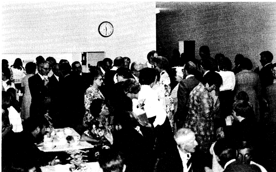
A social hour concludes the festal gathering.