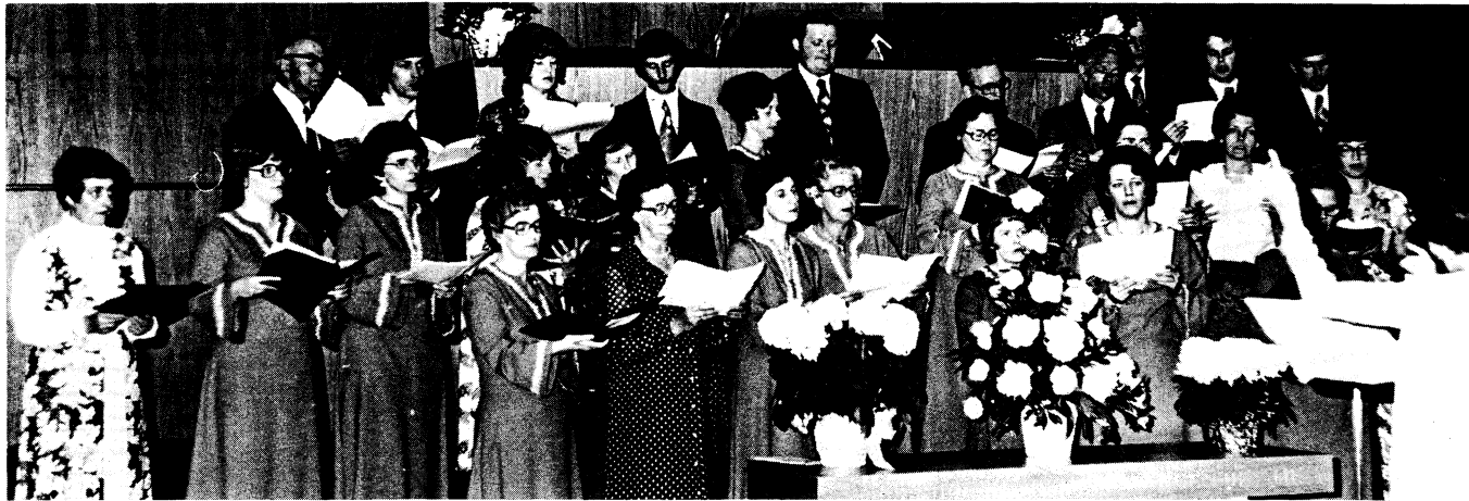
The Choir of the Maranatha Church.