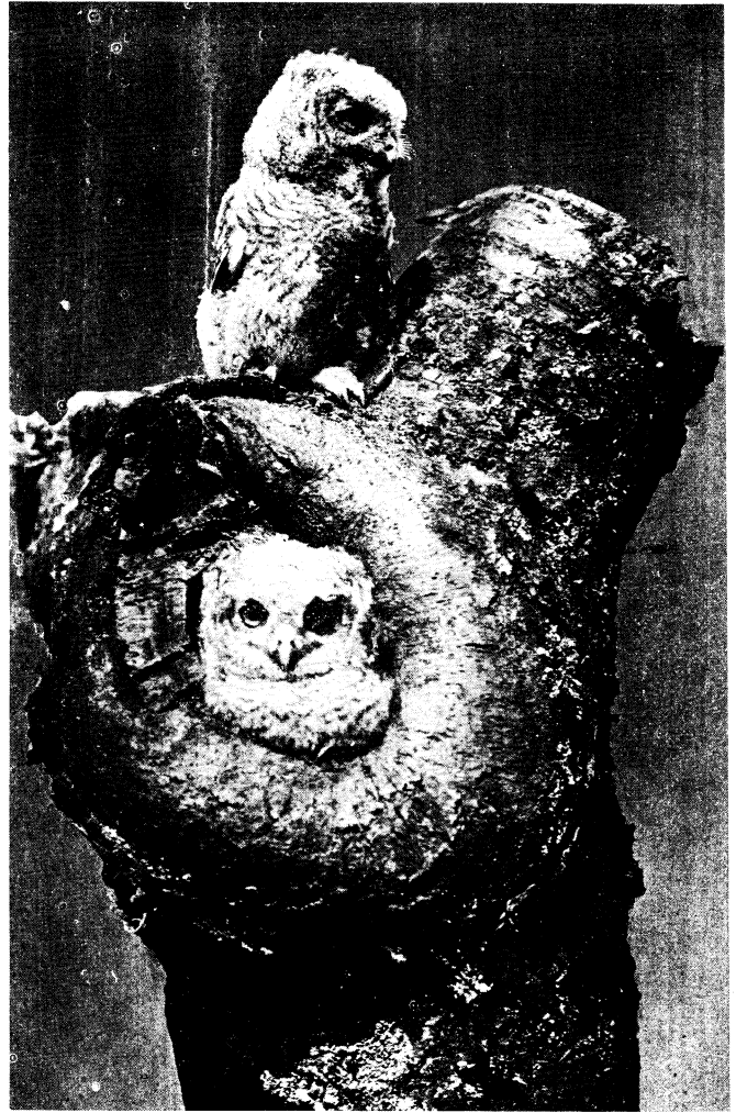
Young Screech Owls.

As it kept growing darker under the trees and as I knew that I was surrounded by at least five owls of which two continually made a swoop at me, the atmosphere was downright spooky. Every time they dived at me, they went to a different perch and as they kept on hooting this sound came from every direction, giving the impression that not only the