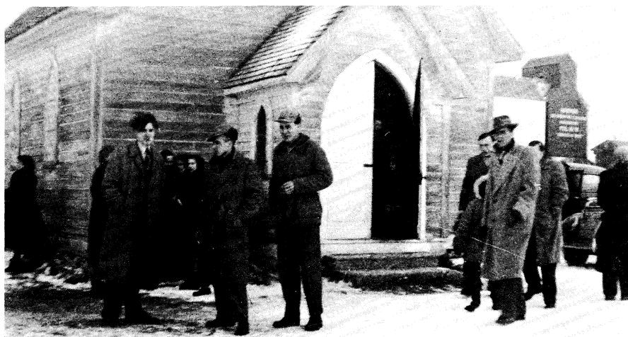
The Congregation of Homewood, Manitoba meeting in the Old Anglican Church in the early 50's.

It was very isolated in Homewood, as far as church life was