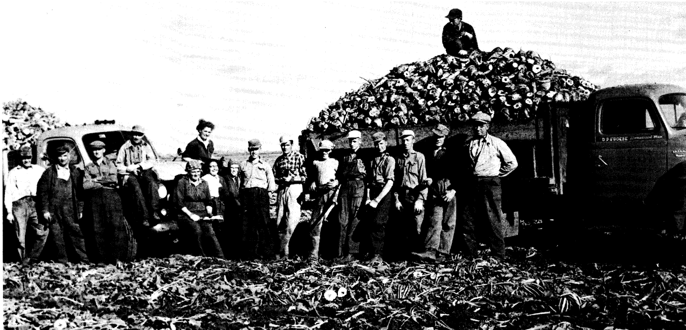
Immigrants working in the sugarbeets in Homewood, Manitoba, 1953.