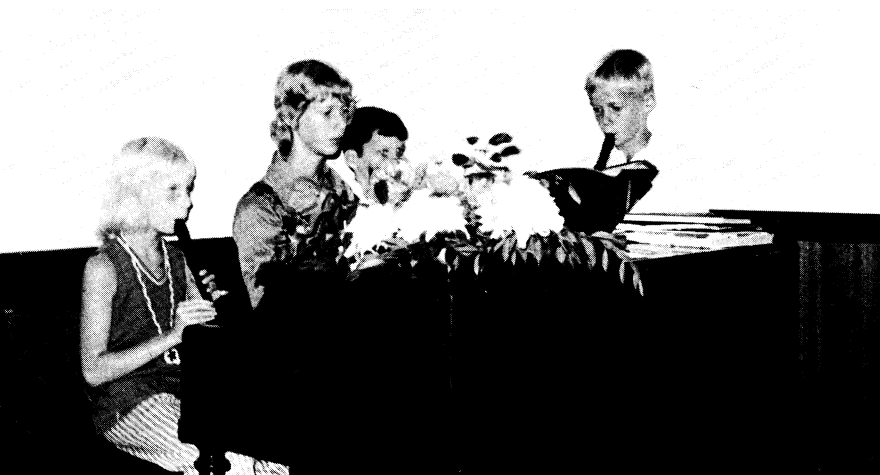
Young musical group participating in the 25th Anniversary celebration.