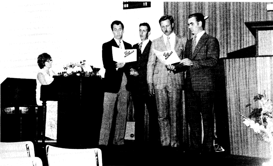
Carman's male quartet singing songs of praise.