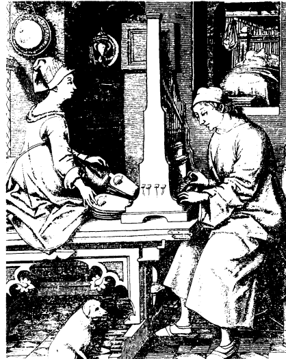
Women's Lib. — Engraving of Israel van Mecken, 15th Century.

Other members of the fraternity of organblowers objected less formally, but more effectively to imagined or real slights. They simply quit pumping at the most inopportune moment. Such was the case in Katendrecht. The bellows there were leaky and faulty. The blower's complaints were ignored. The only course of action which seemed to be open to them was a "strike." The consistory did not take very kindly to such behaviour. The strikers were summarily dismissed, and other blowers were appointed for less money, but not before the bellows were fixed. In Amsterdam, the blower, after the customary strokes for a cer-