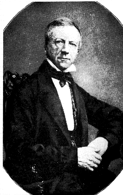
Groen van Prinsterer “Dutch Reformed Parliamentarian”