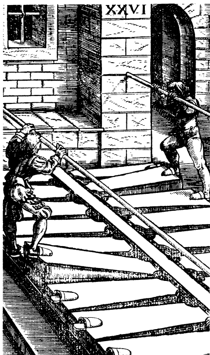
In the bowels of the organ — Organ at Halberstadt, Germany, 1361.

The modern organist no longer needs to engage the services of such