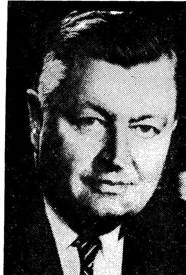
Dr. Carl McIntire "loses friends . . ."

News items are published with a view to their importance for the Reformed Churches. Selection of an item does not necessarily imply agreement with its contents.