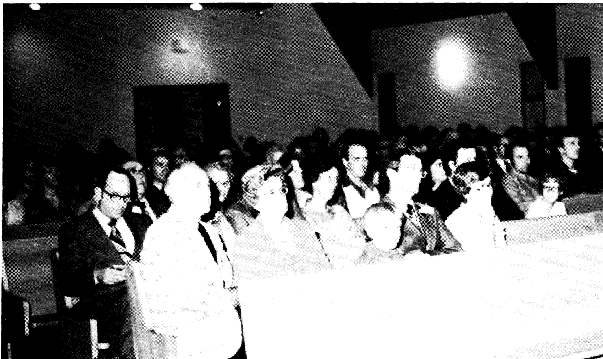
First Row: Three generations of the VanDam family.