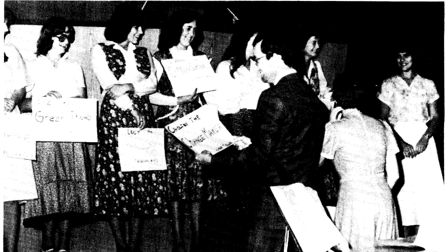
The Young Ladies' Society kept the minister and his wife busy.

We are grateful to our heavenly Father that the regular pastoral work may continue again in our congregation.