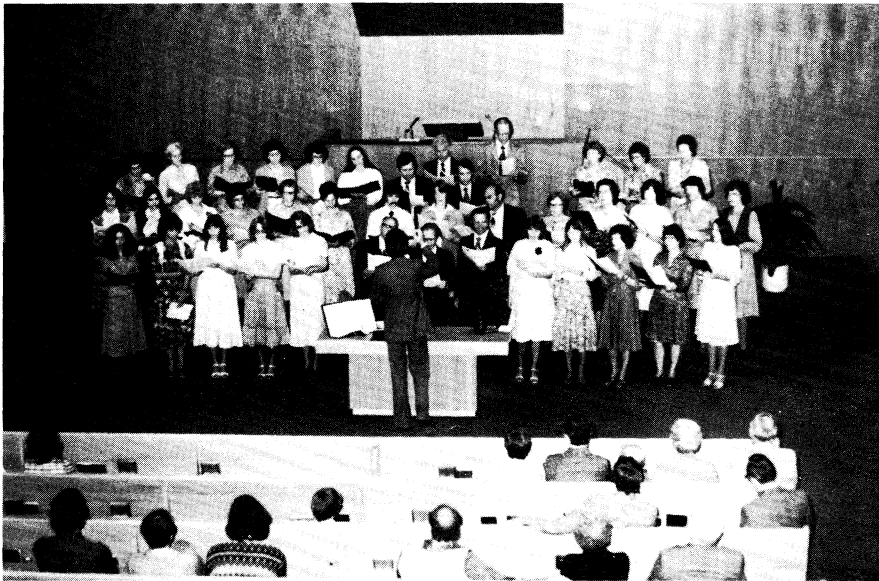
The Choir "Jubilato Deo."