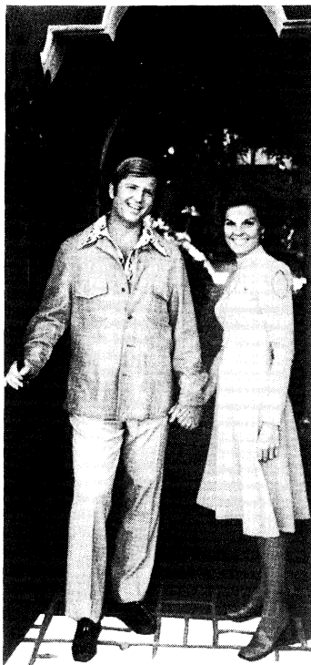
"Bob Green and Anita Bryant."

Perhaps the Bryant-Green marriage itself became too much of a model and symbol, and, although showing outward lustre, began to lack inward depth. This marriage was built up too much as a "testimony that the Christian family is alive and well." Perhaps unwittingly the emphasis came to lie on the human performance of the two celebrities and not on the blessing of God. The impending divorce does reveal a growing rift between two talented, strongly-differing personalities. It becomes clear that even Anita Bryant — symbol of American motherhood and purity — could not mix a high-profile career with a full-time task as homemaker. Ultimately we might even say that the evangelical glitter and shine type of Christianity of Anita Bryant and others does not give the basis it pretends