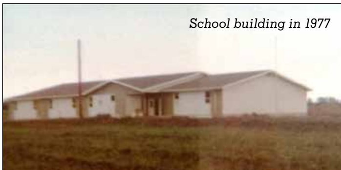
School building in 1977